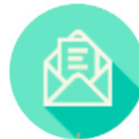
WRITING FORMAL DOCUMENTS