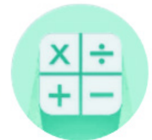
REAL WORLD MATHS